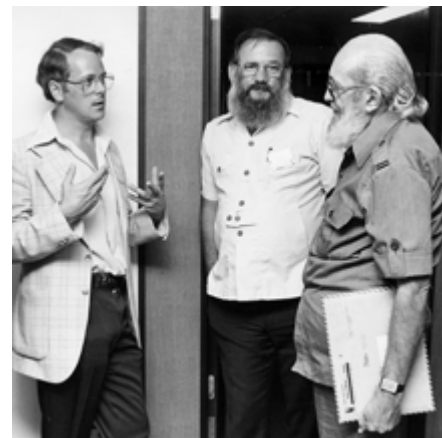
Paolo Freire (r) at Athabasca University, Alberta

act as a learner. In other words, teaching is the form that the teacher or educator possesses to bear witness to the student on what knowing is, so that the student will also know instead of simply learn. For that reason, the process of learning implies the learning of the object that ought to be learned. This preoccupation has nothing to do exclusively with the teaching of literacy skills. This preoccupation establishes the act of teaching and the act of learning as fundamental moments in the general process of knowledge, a process of which the educator on the one hand and the educatee on the other are a part. And this process implies a subjective stance. It is impossible that a person, not being the subject of his own curiosity, can truly grasp the object of his knowledge.